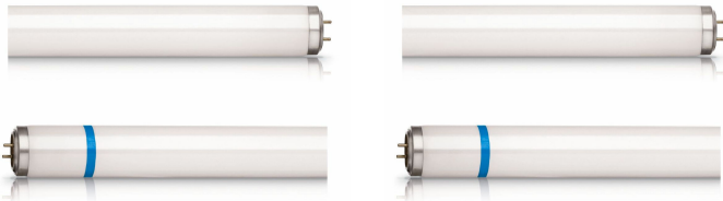
TL-D (K) Secura