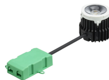
CoreLine Recessed Spot RS140Z 1Acc