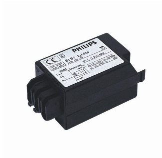
SN 58 T5